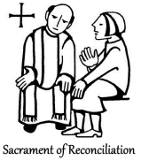
Sacrament of Reconciliation